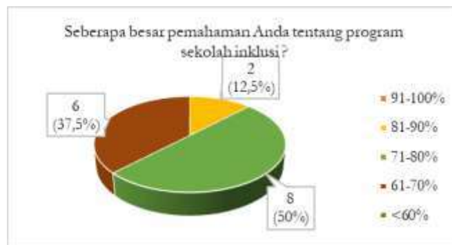
Figure 2. Understanding of the Inclusive School Program

How much do you understand about inclusive school program?