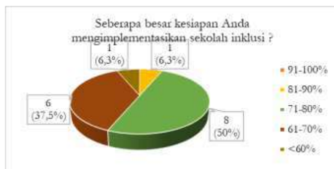
Figure 4. Readiness in Implementing the Implementation of Inclusive Schools

How much is your readiness in implementing inclusive school?