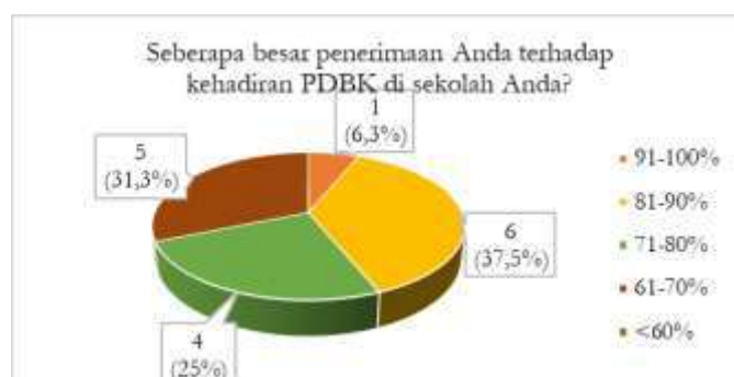
Figure 6. Acceptance of SWSNs

How much do you accept SWSNs in your school?