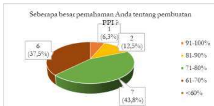
Figure 7. Understanding of Making PPI

How much do you understand in making PPI?