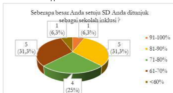
Figure 3. Appointment as an Inclusive School

How much do you agree if your elementary school is appointed as an inclusive school?