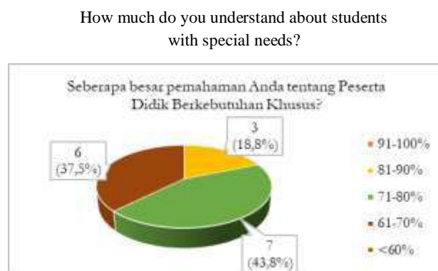
Figure 1. Understanding of SWSNs

The results of the research questionnaire stated that 97.9% of respondents were ready to implement the inclusive school program in Jepara Regency with a readiness range between 61-100% and 2.1% of respondents answered that they were not ready. The readiness level of elementary school teachers can be seen in terms of their understanding of students with special needs, the curriculum used, ILP, and their acceptance of SWSNs in schools.